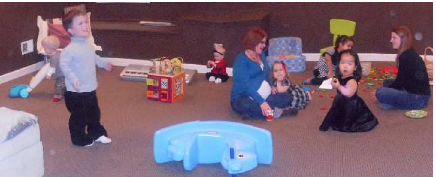
Kids Having Fun