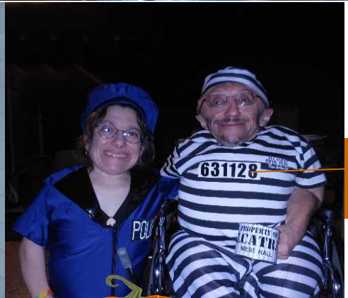
Best Adult Male Costume Winner