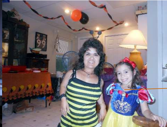
Best Children's Costume Winner