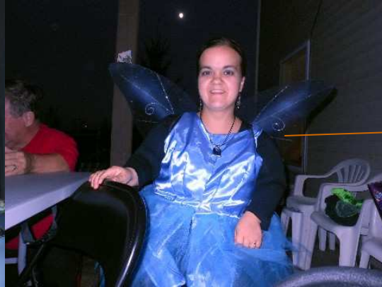
Best Adult Female Costume Winner

See you at the Holiday Party at my house!